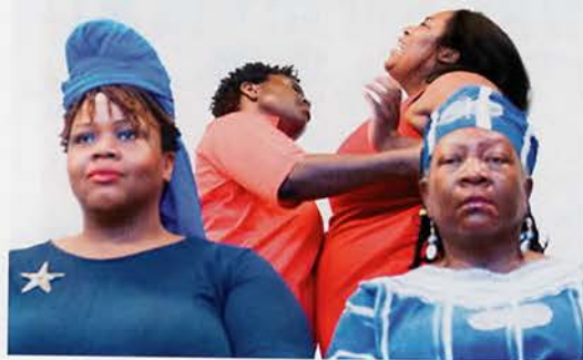
View of Autumn Knight's performance WALL at the Contemporary Arts Museum Houston, 2016.

into the performance area and force the performer to stop choking himself.