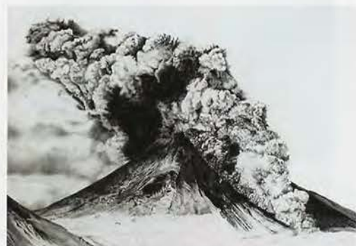
Debra Barrera: Mount Pavlof , 2015, graphite on paper, 18½ by 26¼ inches.