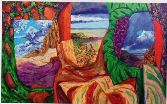
Earl Staley: Portal Series #19 , 2015, acrylic on canvas, 29 by 63 inches.