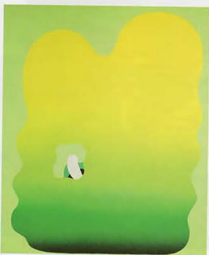
Alikea Herreshoff: The Passenger , 2015, acrylic on canvas, 24 by 20 inches.