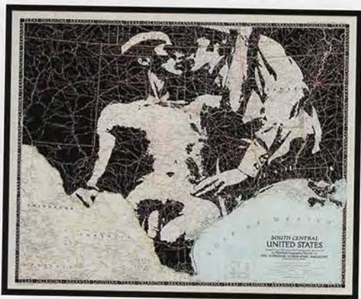
Nick Vaughan and Jake Margolin: South Central U.S.: Pinups , 2014, acrylic on hand-cut found road map, 30 by 35 inches.