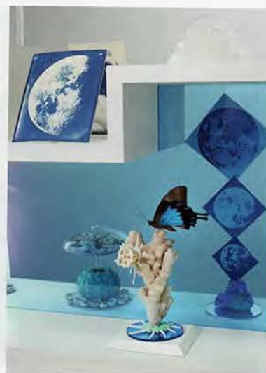
Dario Robleto: Harvest/Harvest Moon (detail) , 2014–15, cyanotypes of various moons in the solar system, crystals, paper, feathers, and mixed mediums, 30 by 69 by 16 inches overall.